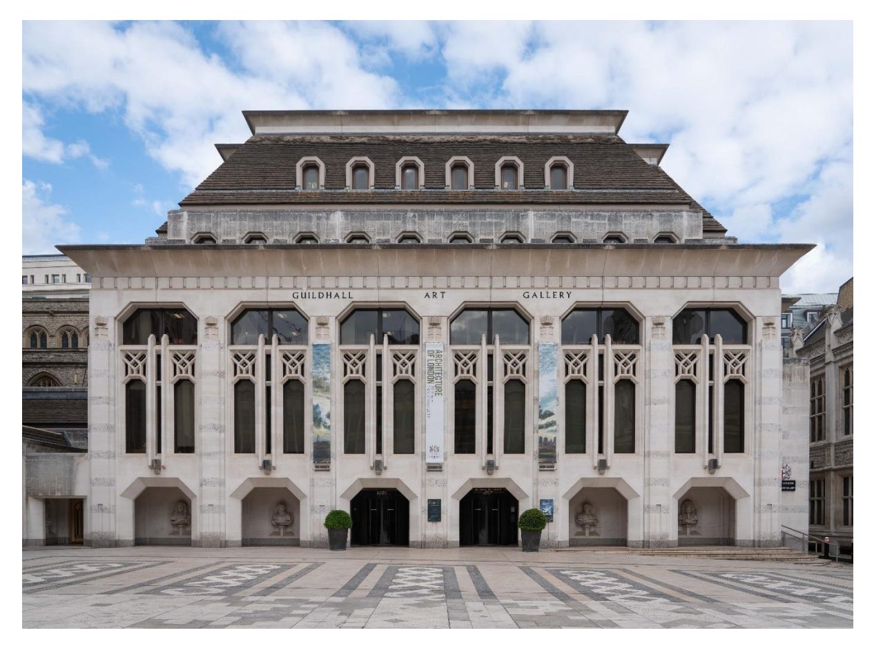
Figure 3: View of Guildhall Art Gallery from Guildhall Yard.