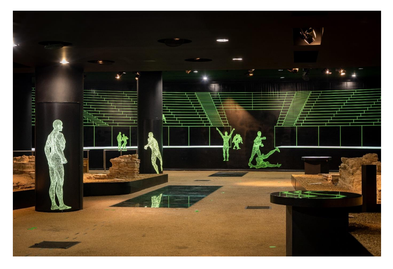
Figure 5: London's Roman Amphitheatre