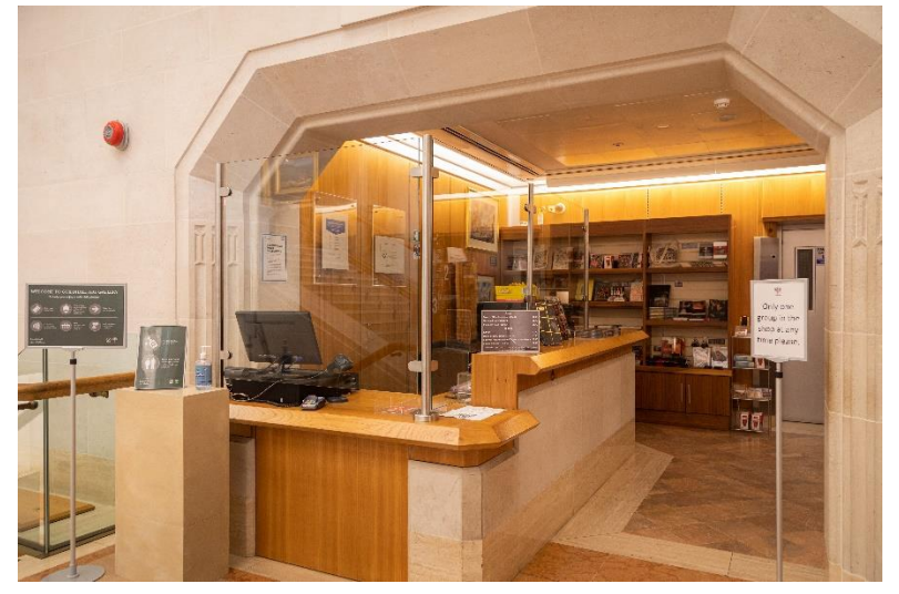
Figure 2: View of the front desk/ information desk at Guildhall Art Gallery.