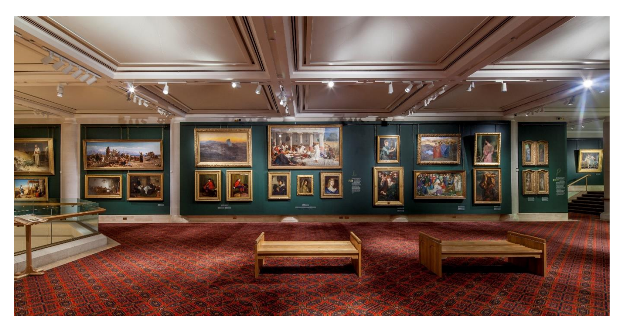
Figure 4: Inside Guildhall Art Gallery, Victorian Collection on the First Floor.

At the Gallery we have a team of wonderful staff made up of Security Officers, Volunteers and the Front of House Team. If you require extra help during your visit then just let us know and someone will be there with you.