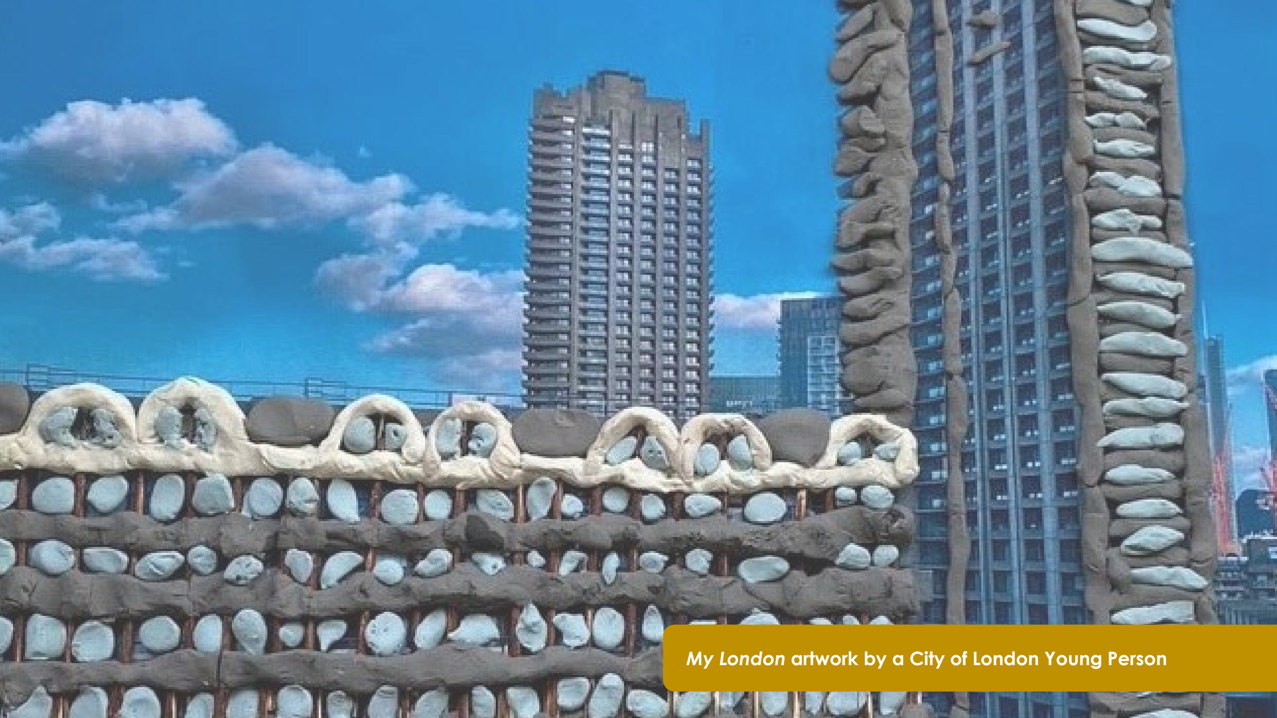
My London artwork by a City of London Young Person