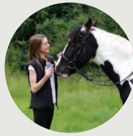
Left to right: Enjoying the permissive horse ride route at Warlies; Riders of all ages can explore Epping Forest; Pausing for a pat.

For further information or to purchase a licence please contact: Chingford Golf Course, Bury Road, London E4 7QJ Tel: 020 8529 2085 epping.forest@cityoflondon.gov.uk www.cityoflondon.gov.uk/eppingforest